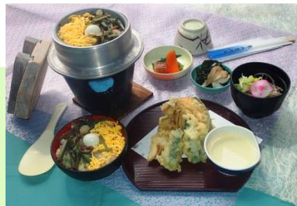
Sansai Kama-meshi Komorebi ¥1000