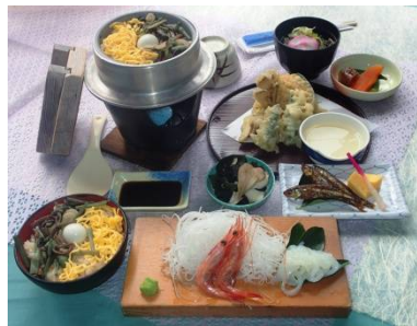
Sansai Kama-meshi Yamanami ¥1500

Reservation of the group is accepts , but because other customers also at the same place, there is a case where you wait. Please note.