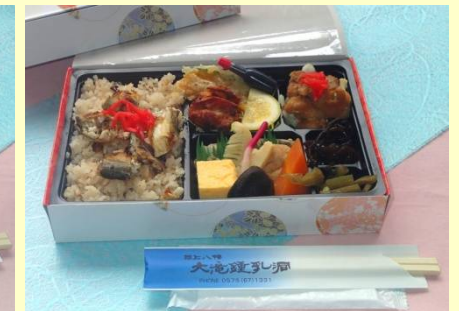
Ayu-meshi box ¥1000