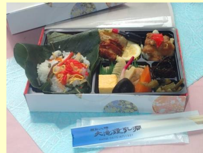
Hoba-sushi box ¥1000