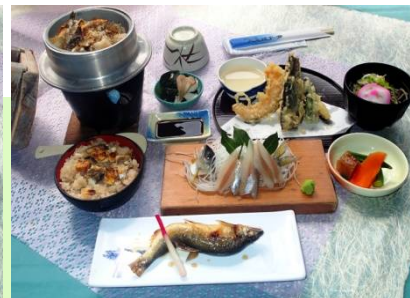
Gujo ayu-meshi ¥1700