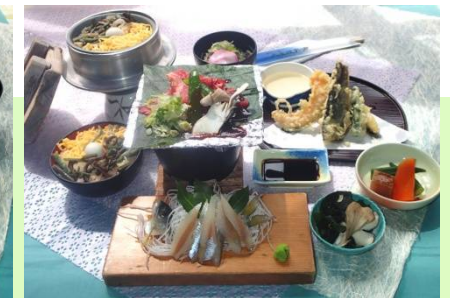
Beef hoba-miso-yaki ¥2000